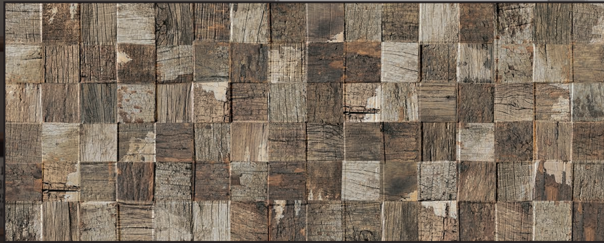
GREY/BROWN 3-D DECOR Matte 32 x 80.5 cm (12.59 x 31.69) BC.FL.GBW.1232.DC

This collection interprets the timeless appeal of wood in its infinite variety to create stylish spaces and ideas for contemporary living. Flair emphasizes the warmth of wood whose appearance reflects the passage of time.