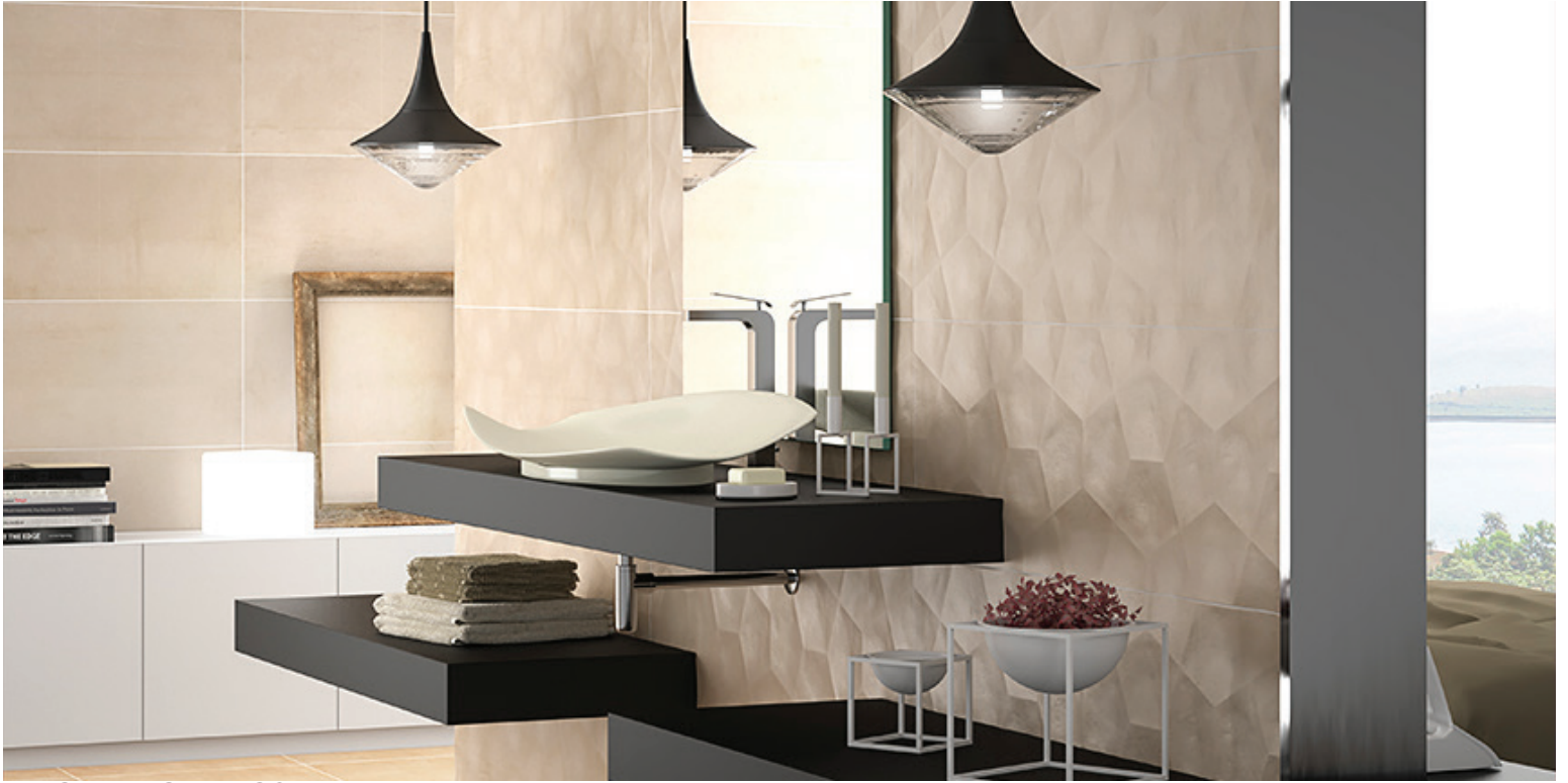
BEIGE, BEIGE DECOR