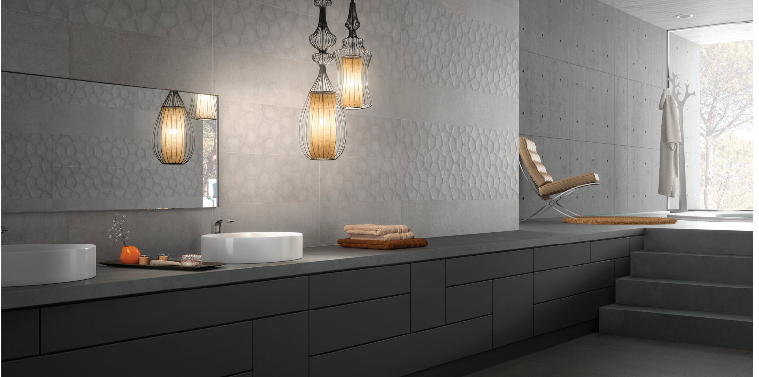
GREY, GREY DECOR